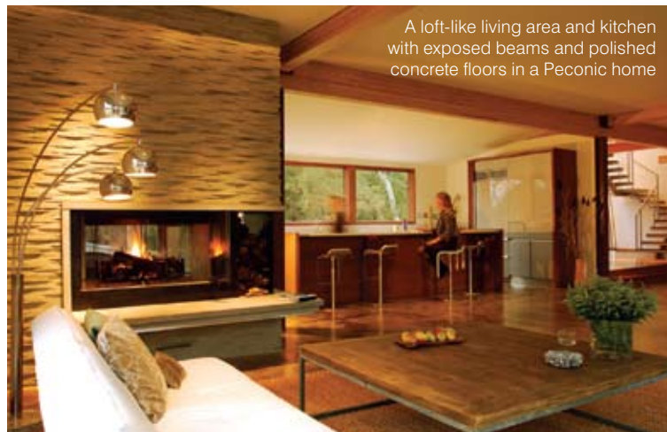
A loft-like living area and kitchen with exposed beams and polished concrete floors in a Peconic home

Freedom, or at least freedom from prescribed looks and trends, is in the air. It will be enlightening to see what participating designers do with their rooms in the show house this summer—and how the latest cohort of buyers in the Hamptons fulfill their dreams and furnish their homes. For information on the show house or to inquire about gala tickets, call 745-0004.