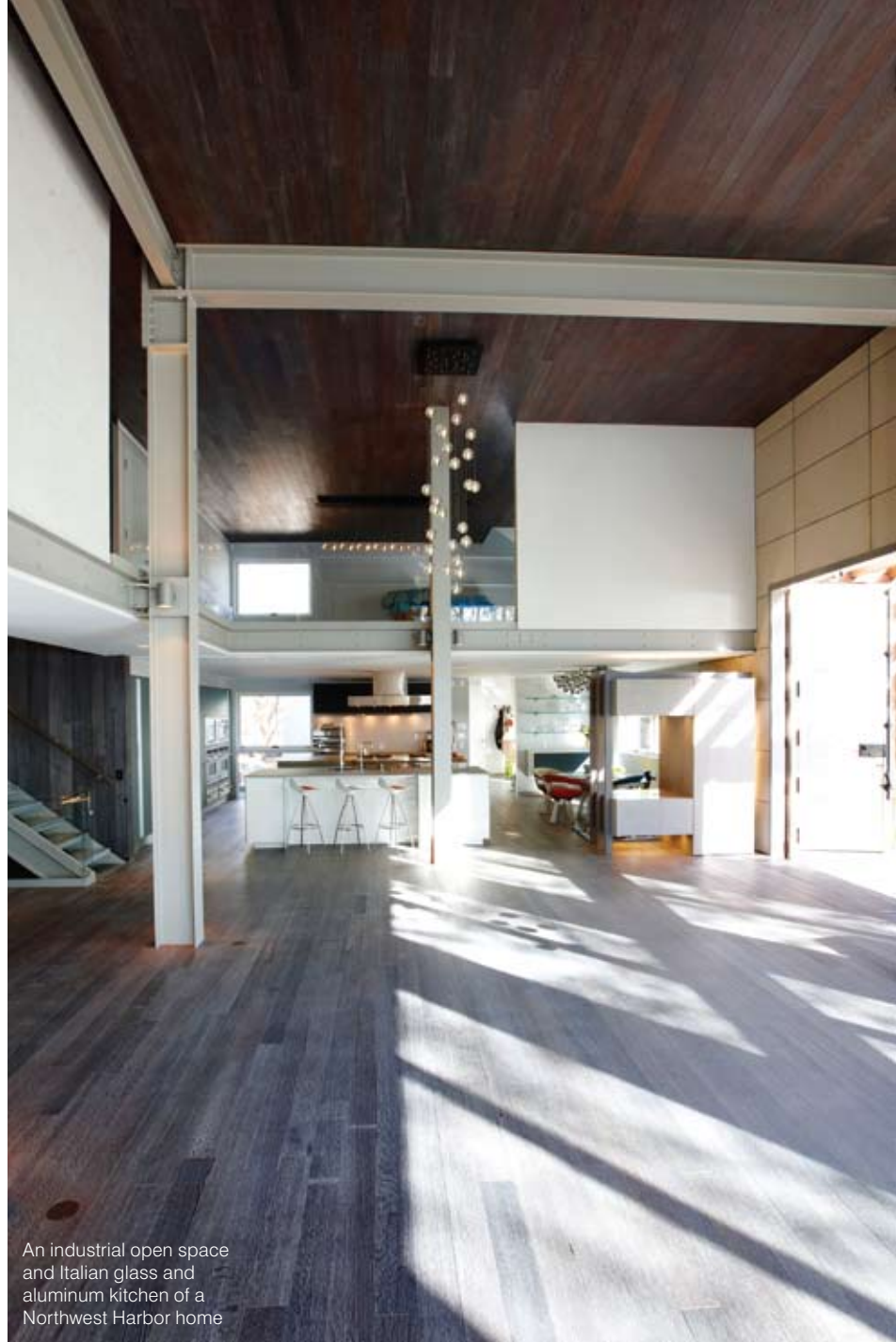
An industrial open space and Italian glass and aluminum kitchen of a Northwest Harbor home